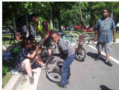
Cub Scouts learned bike safety and maintenance at the Cheverly Day Bike Rodeo