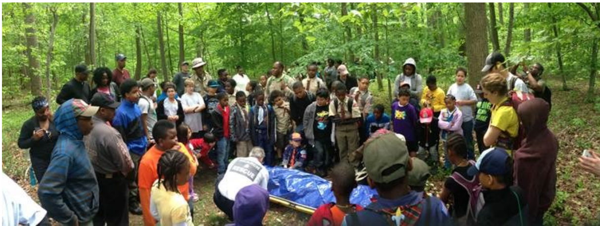
More than 70 Scouts trained in first aid, land navigation and search and rescue skills

Refreshments will be provided. Anyone interested, please call the Church Or 301 773 5123 between 10:00 – 2:00pm , Wednesday – Friday.