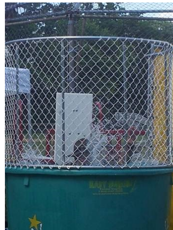
Cub master takes the plunge in the Cheverly Day dunk tank.

Graduating 6 year olds can join RIGHT NOW as rising TIGERS! For more information contact Cub master Dave ( davidja2@dni.gov )