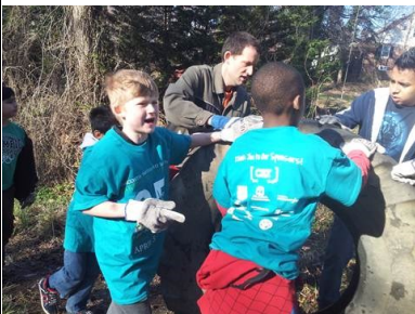
Scouts remove a tire during the Anacostia Watershed Earthday Clean-up