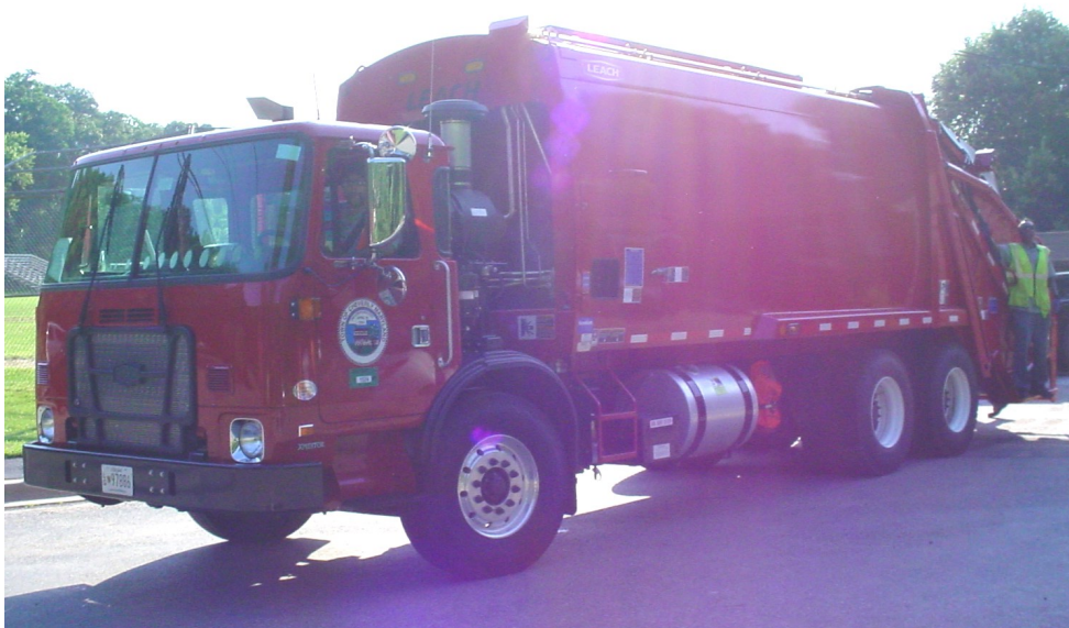
HERE IT IS: Our New Trash Truck on the Road June 14, 2014.

I am very happy to say, that since the first few months of the program I have never received a single complaint regarding the administration of the Speed Camera Program. I applaud the Town Administrator, Police Chief and the staff that monitors the program for their integrity in administering the program.