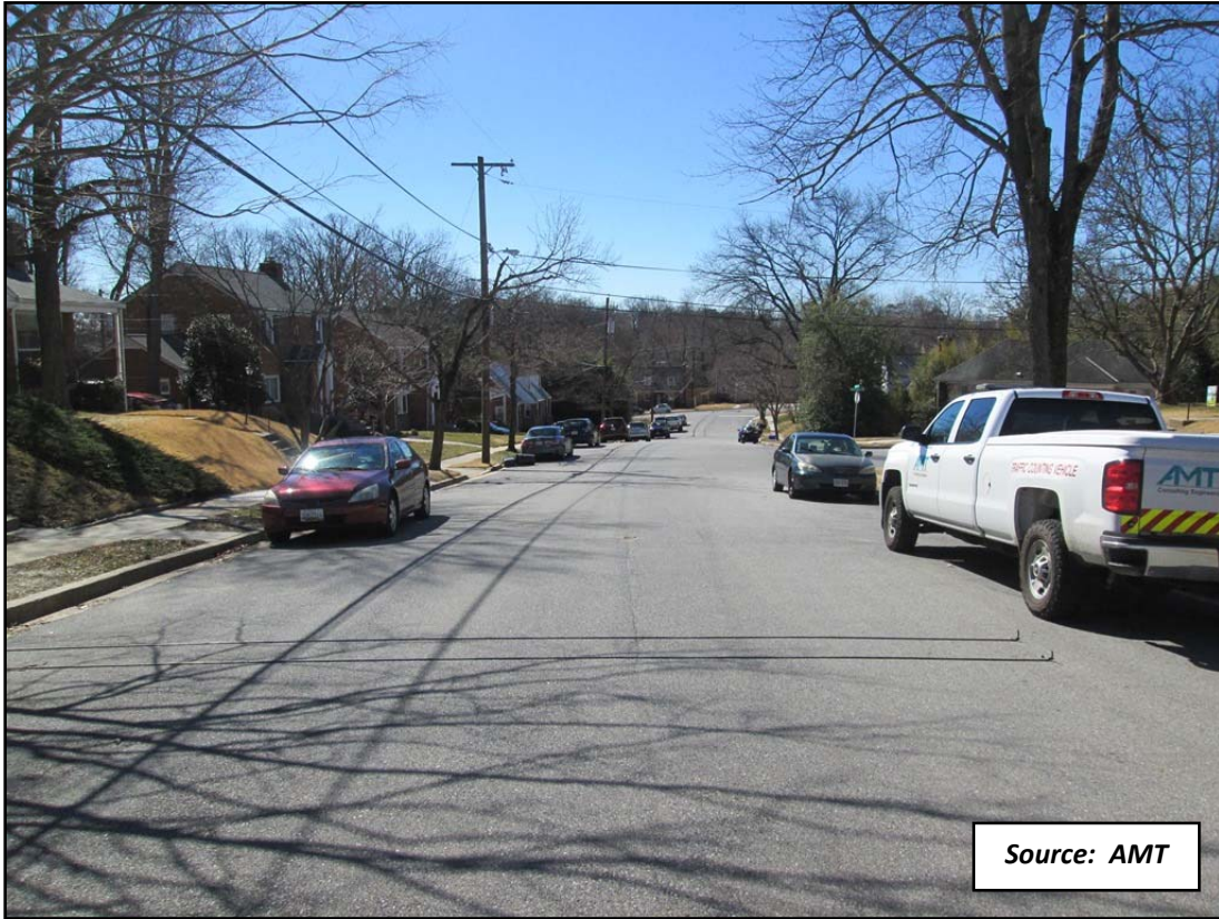
Tremont Avenue – Looking South