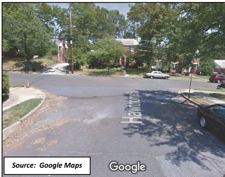
Hawthorne Street – Looking East