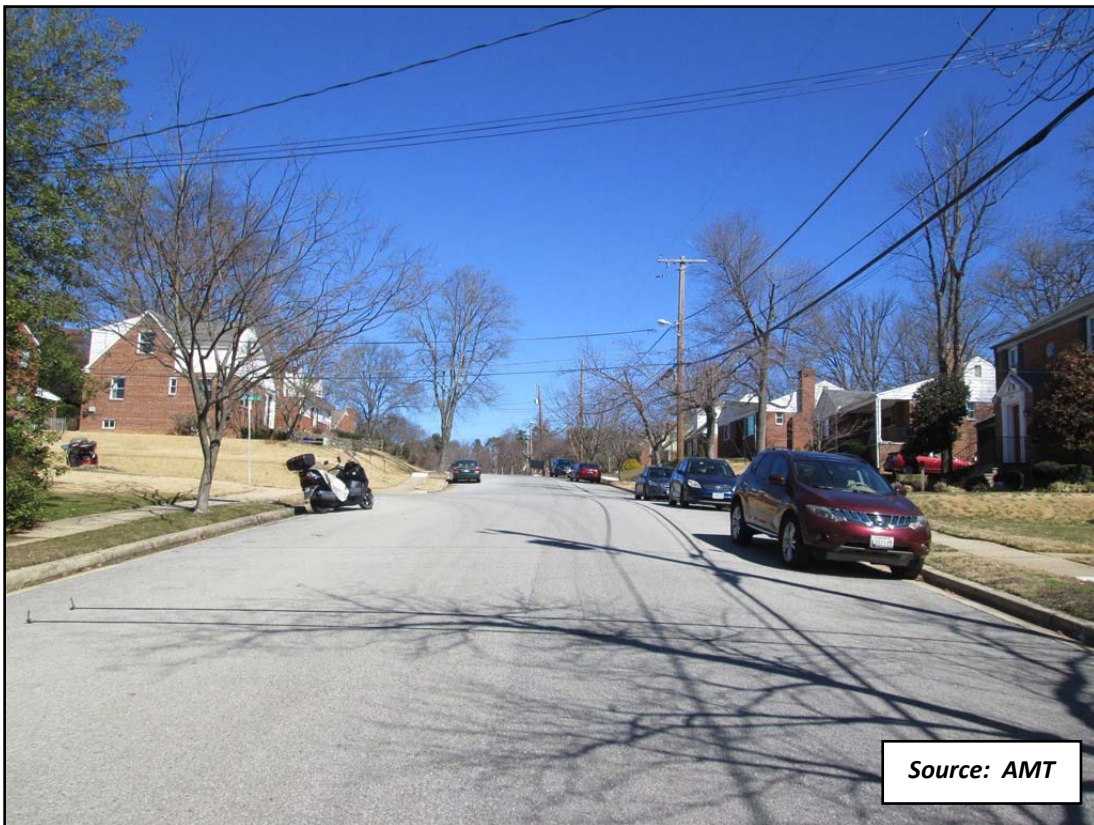
Tremont Avenue – Looking North

The intersection of Tremont Avenue and Hawthorne Street is a T-intersection with a STOP sign on the Hawthorne Street approach. The STOP sign is in good condition. There are no crosswalks across the three (3) approaches. The pedestrian ramps appear to be ADA compliant.