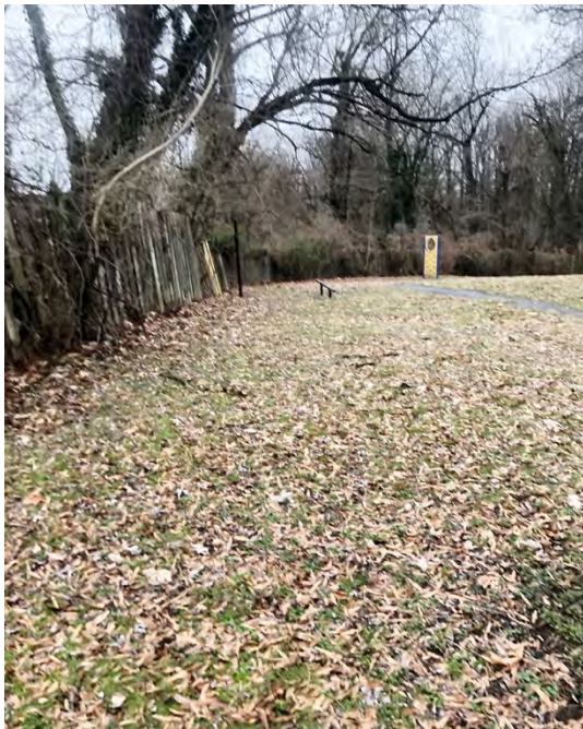
Boxelder trim dead wood elevate

Snag - standing dead tree, dbh diameter at 4.5' above ground level