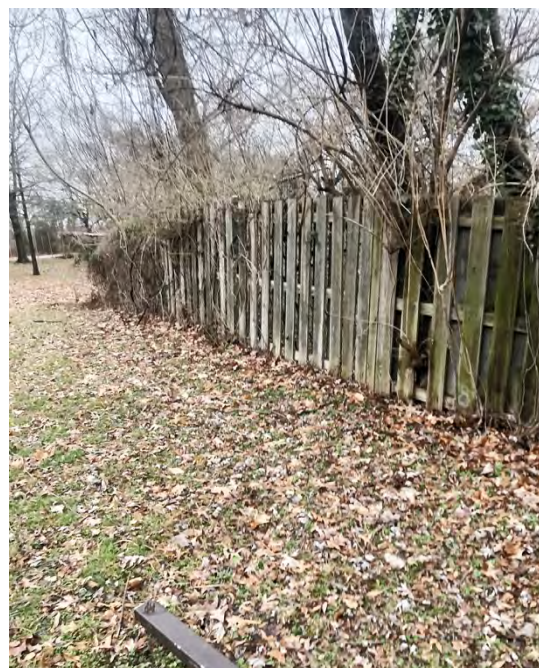
Trim shrubs and trees over fence