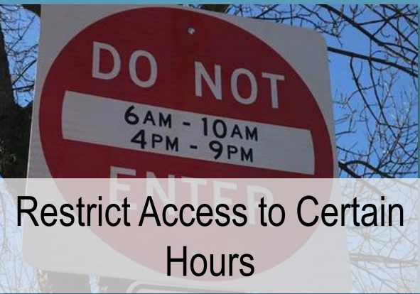
Restrict Access to Certain Hours