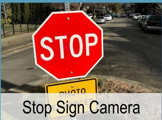
Stop Sign Camera