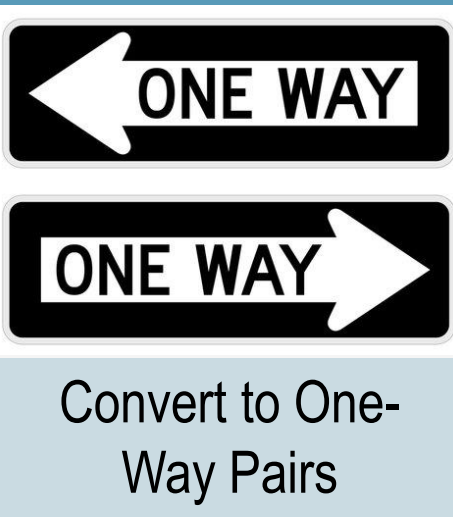
Convert to One-Way Pairs